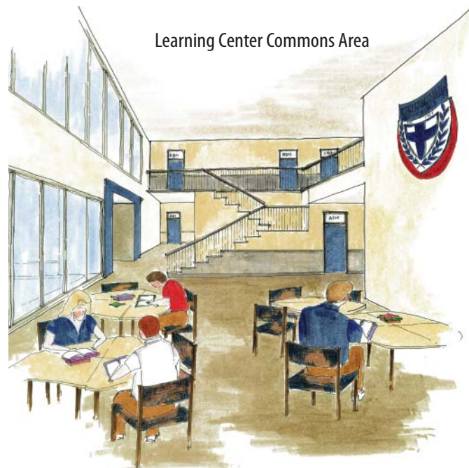
Learning Center Commons Area