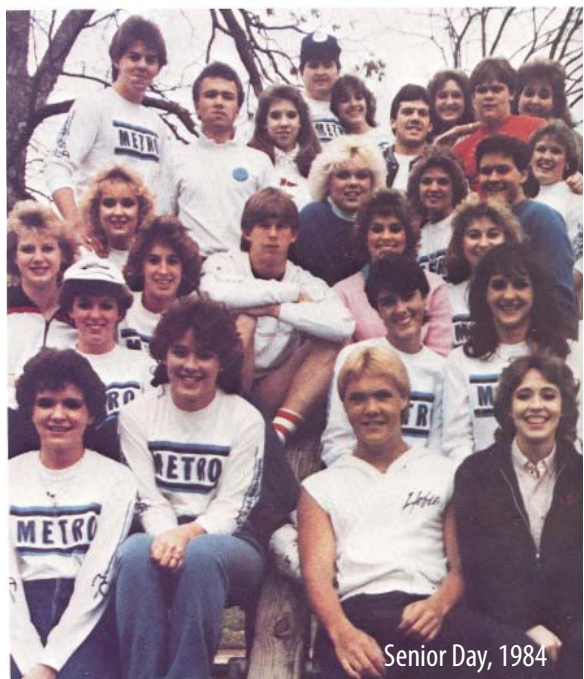
Senior Day, 1984

“What those families and educators did twenty-five years ago was remarkable. Because of their dedication and foresight, so many children and families have benefited from the Christian education Metro provides. Today, we have that same opportunity. An opportunity for this generation of parents and leaders to move Metro beyond the next 25 years. An opportunity that ensures Metro will continue to meet the needs of this and future generations of faculty and students.”